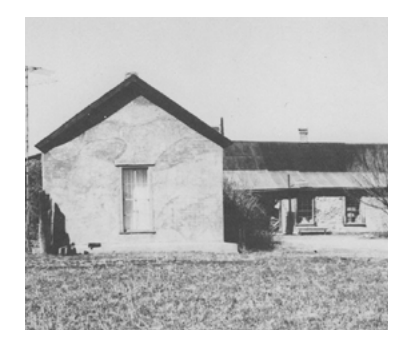
Selected images from "Lincoln, New Mexico: A Plan for Preservation and Growth"